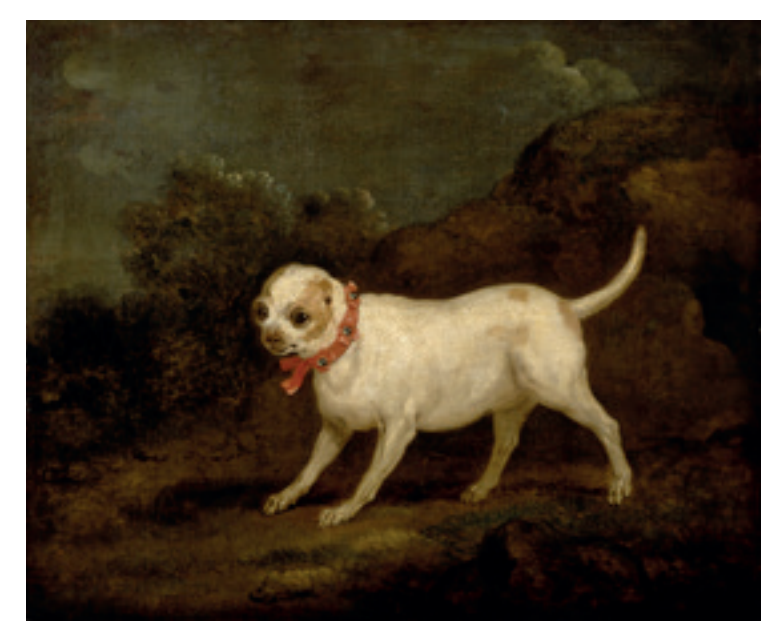
fig. 29 A pug with a red ribbon, J. B. Oudry, oil on canvas, 54.5 x 65.3 cm. Lille, Palais des Beaux-Arts, inv. no. Inv.P.348.

was still being produced at Derby in 1820 (cat. no. 58), and was then reinterpreted at Minton around 1830 (cat. no. 59). These figurines, on flat bases with rococo edges painted in different colours, suggest that they formed part of a composite work. FIG 7 FIG 8 A-E