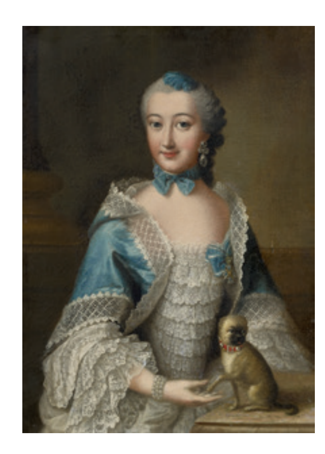
fig. 18 Barbara Rosina de Gasc [1713–1783], attrib., Portrait of a Young Lady of the Order of the Pug Dog, oil on canvas, ca. 1770, 45 x 34 cm. Sold at Van Ham, Cologne, 15 November 2013, lot no. 532.

To return to the subject of the porcelain figure of Brühl's favourite dog: it is seen sitting on a rectangular cushion (richly decorated in the case of the example preserved in the present collection), almost life-size, with its right paw raised level with its shoulder. The pug is of slender physical build, with a fine round head; though its muzzle, from which protrudes a little pink tongue, is more prominent than those of the pugs that Kändler modelled in 1741. Around its neck is a broad gold and purple collar decorated with the initials of